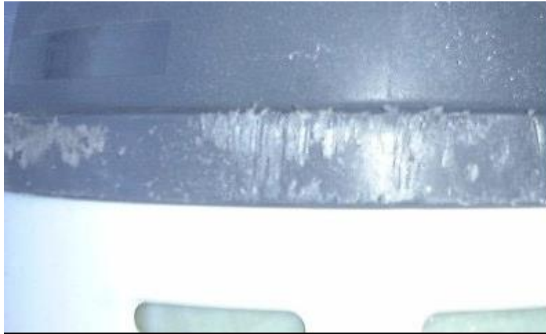
Figure 1: Acceptable outer casing damage caused by abrasion

Damage that affects the protective function of the casing is unacceptable. If unacceptable damage is identified, the cylinder must be rejected or the casing removed from the cylinder and the cylinder inspected for damage in accordance with condition 2)i) of this certificate. If the cylinder is acceptable, a new casing may be installed.