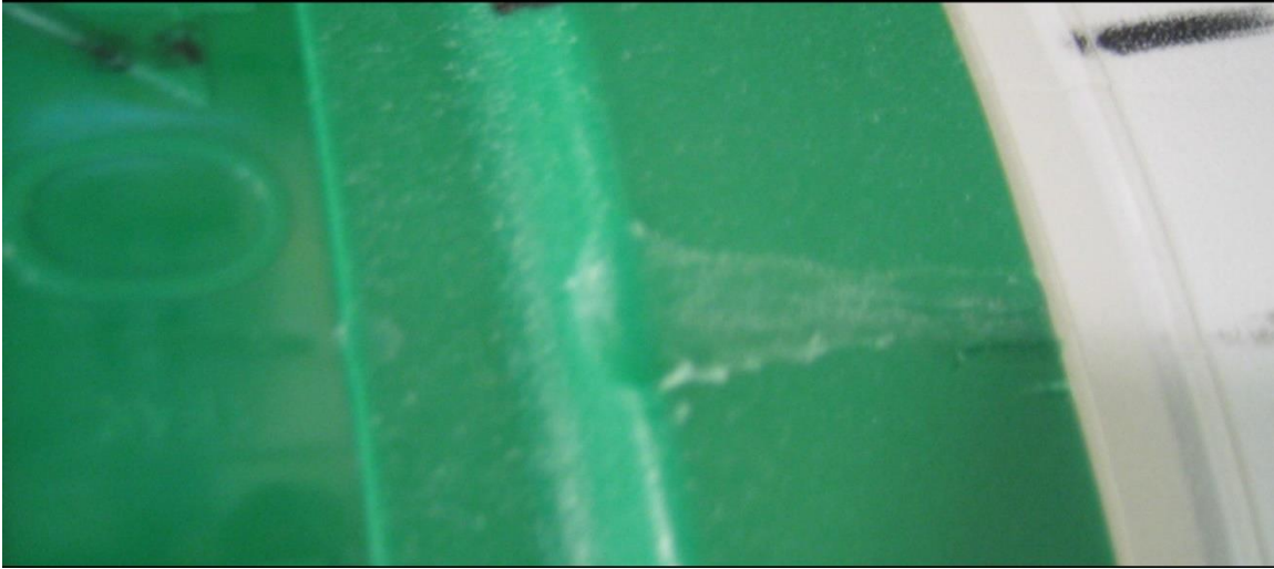
Figure 4: Damage sustained from a horizontal drop, which is the most severe for this type of cylinder. If these marks are found in the cylindrical area or at the joint between the upper and lower casing, the cylinder must be rejected.