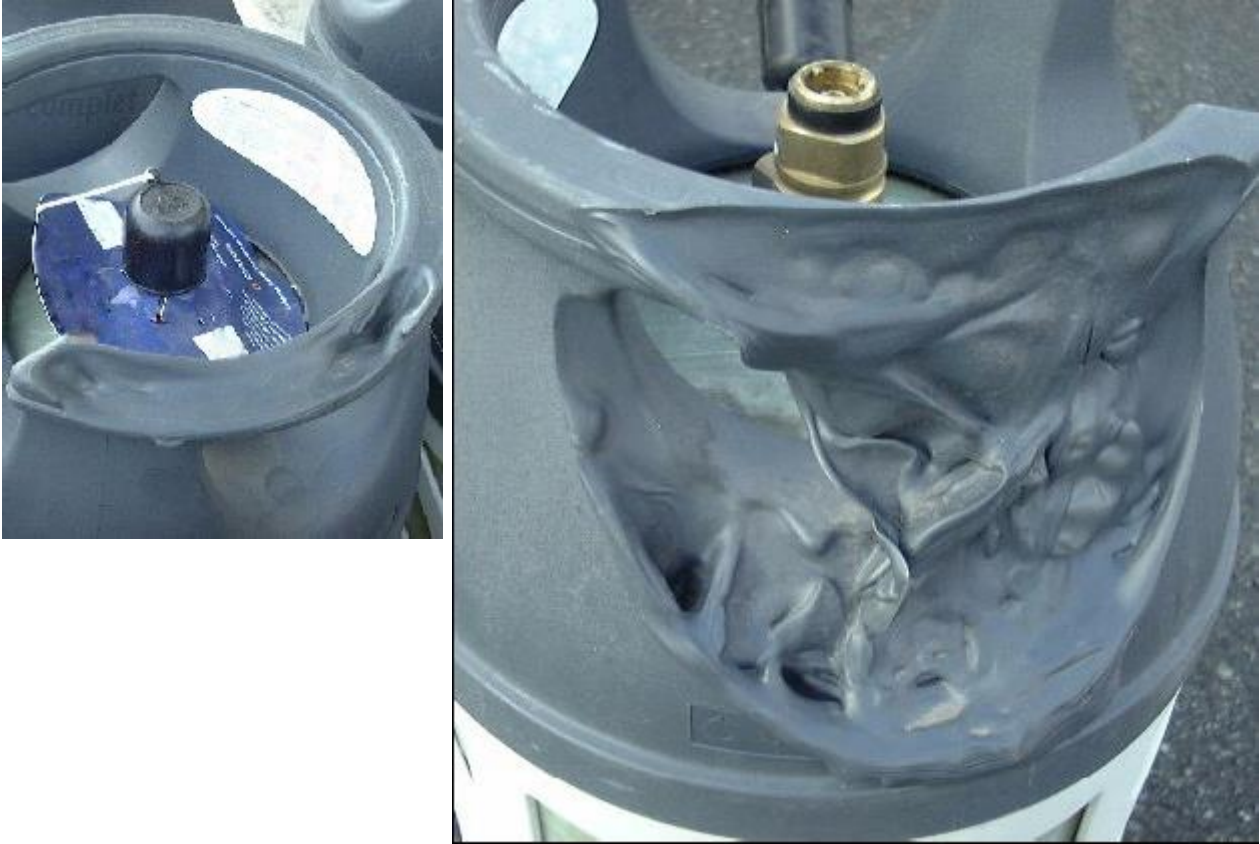
Figures 5 and 6: Unacceptable outer casing heat damage